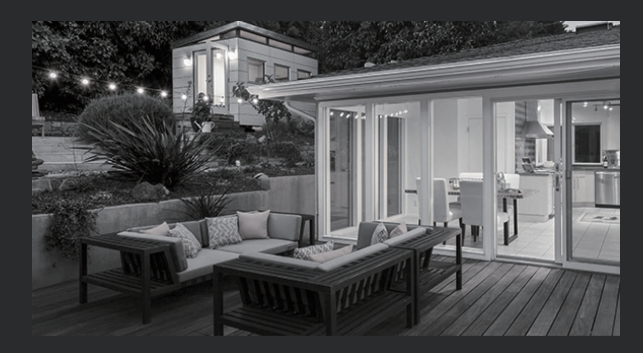
Night images from the C3WN

Experience it with the C3WN, seeing in the dark by using powerful Infrared LED lights.