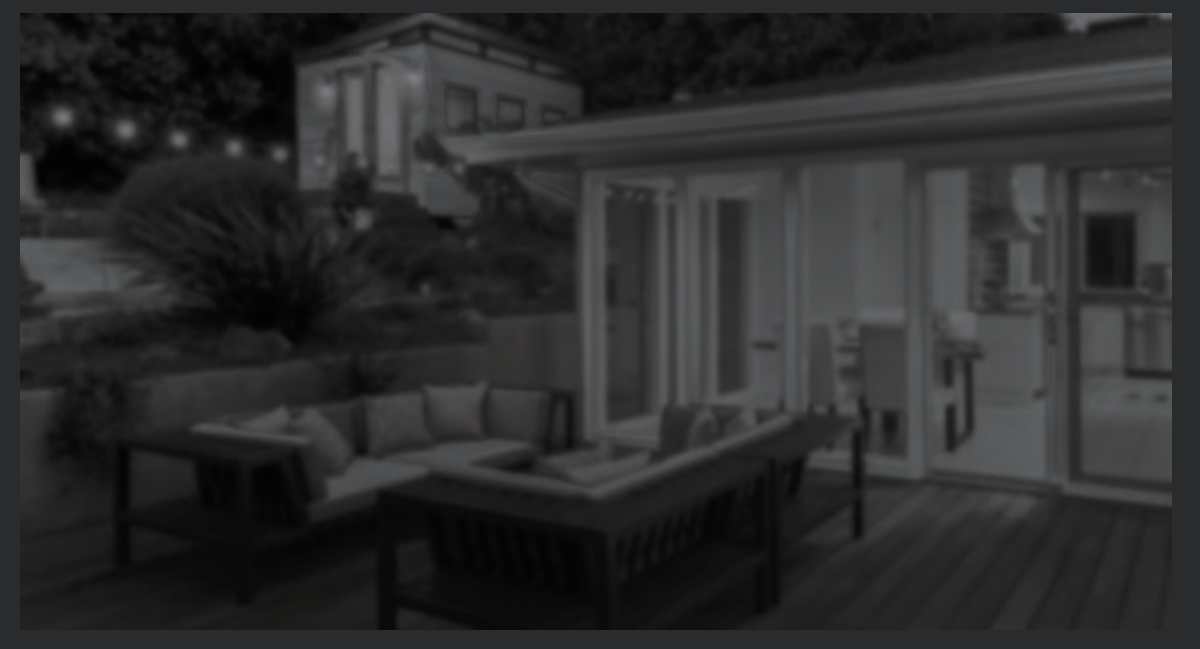
Night images from other cameras