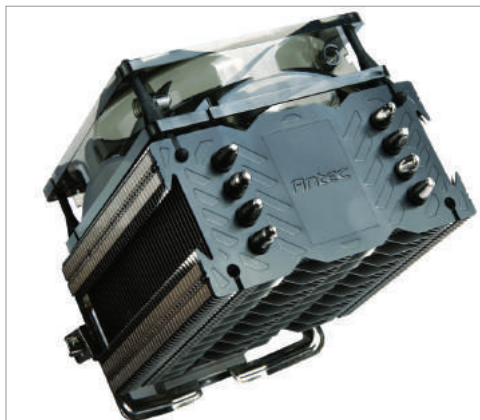
Aluminum oxide coating on the top fin boosts the efficiency of heat transfer and prevents oxidation