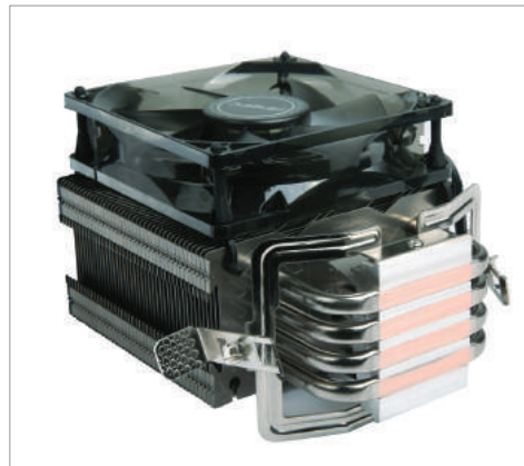
Straight Touch copper coated heatpipes provide full contact to the CPU, for more efficient heat transference