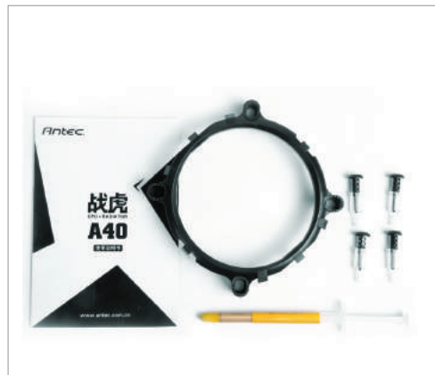
Compatibility with Intel and AMD platforms, and the push-pin mounting system and included thermal paste make for a fast, simple installation