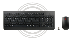
Lenovo 510 Wireless Combo Keyboard & Mouse