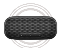
Ultraportable Bluetooth® Speaker

* Example of Lenovo Yoga Duet catalogue naming convention