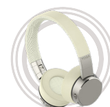
Active Noise-cancellation Headphones