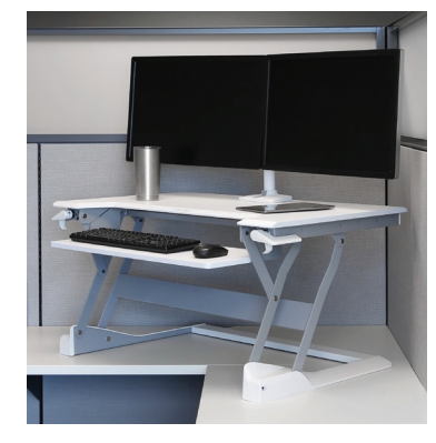
SHOWN WITH WORKFIT-TL SIT-STAND WORKSTATION

FACH MONITOR HAS INDIVIDUAL UP/DOWN TILT