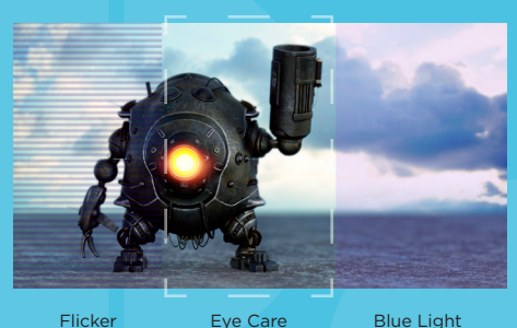
Eye Care Technology

Enjoy tear-free and stutter-free gameplay with AMD Radeon FreeSync™* technology. Its 1ms response time with MPRT** eliminates streaking and ghosting, while the 144 Hz refresh rate reduces motion blur, allowing you to play your favorite games without any distractions.