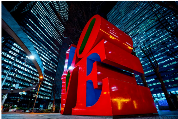
Focal Length: 11mm Exposure: F2.8 1/4sec ISO: 100

The 11-20mm F/2.8 Di III-A 2 RXD (Model B060) is a fast-aperture ultra wide-angle zoom lens for Sony E-mount APS-C mirrorless cameras. The lens features the world's first F2.8 maximum aperture for Sony E-mount APS-C mirrorless in this category, and an amazing compact and lightweight design. The lens is so light weight and compact that it's hard to believe it's a fast-aperture ultra wide-angle zoom lens. When used with a compatible Sony E-mount APS-C mirrorless camera body, you'll also find it easy to shoot video using a compact tripod or gimbal. Special lens elements are optimally arranged to suppress optical aberrations and to produce clear images for high-resolution performance. Also, the MOD (Minimum Object Distance) of 0.15m (5.9 in) at the widest end and 0.24m (9.4 in) at the 20mm end allows you to get closer to a subject than you ever imagined. The lens incorporates a fast precision AF drive system with an RXD (Rapid-eXtra-silent stepping Drive) stepping motor unit. The 11-20mm F2.8 will expand your enjoyment of shooting by combining excellent portability with the ability to capture images unique to fast-aperture ultra wide-angle lenses.