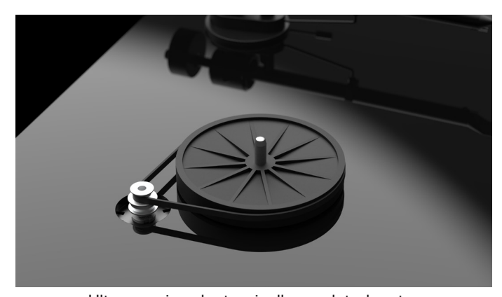
Ultra-precise electronically regulated motor Immaculate speed stability and accuracy

In the T1-line, the motor drives a belt-system, attached to a newly designed sub-platter, which is mounted into an ultra-precise 0.001mm main bearing with a hardened steel axle and brass bushing – just like our coveted Essential III turntables. Alongside the chosen motor system, the T1 is therefore able to ensure a smooth, anti-resonant rotational platform for the tonearm and cartridge to ride across.