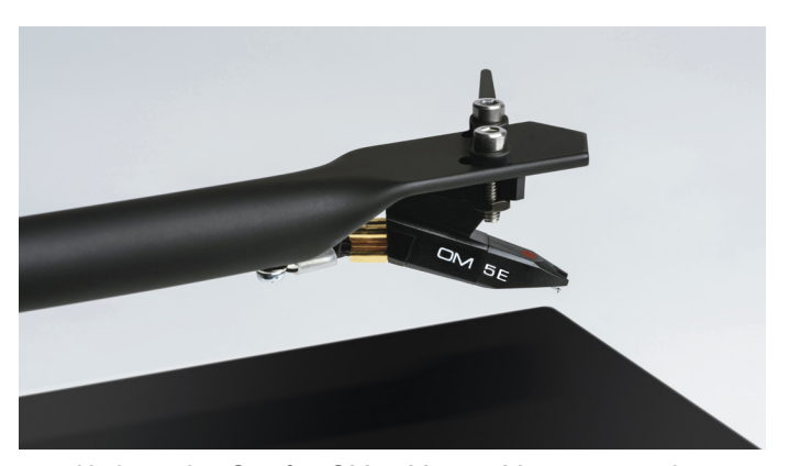
High-quality Ortofon OM5e Moving Magnet cartridge with elliptical stylus tip

Supplied with an Ortofon OM5e Moving Magnet cartridge, featuring an elliptical diamond stylus tip; this is a true hi-fi playback system with no corners cut.