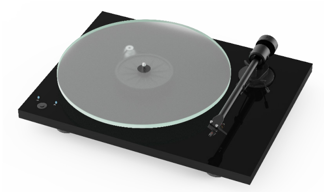
Superb build-quality, stylish looks and audiophile sound Precision CNC'd plinth and heavy zero-resonance glass platter

The stylish CNC-machined plinth, available in High Gloss Black, Satin White or Walnut finish, features no plastic parts and is carefully manufactured to ensure there are no hollow spaces inside, therefore avoiding unwanted vibrations within the chassis.