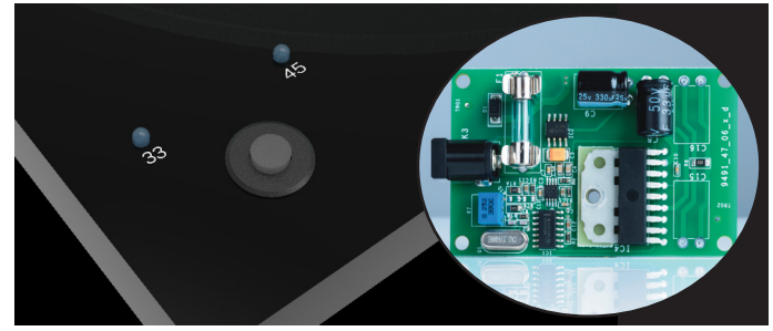
Electronic Speed Switch between 33/45 RPM DC/AC motor control board for best speed stability

For the drive system, where most alternative products may use un-regulated DC motors with wide speed fluctuations, the T1 Phono SB features our proven system of an electronically regulated, precision-speed AC motor. The T1 Phono SB also comes with electronic speed switching between 33 and 45 RPM. The result is a low-noise, stable drive system for the turntable.