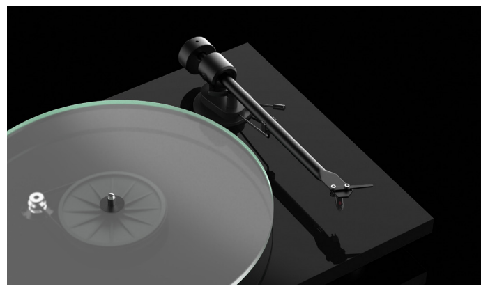
One-piece aluminium tonearm Robust and stiff construction for pure sound fidelity

The tonearm on the T1-line is a new model, based on previous Pro-Ject designs. With its straight, 8.6" effective length and stiff aluminium construction, this one-piece tonearm also features low-friction bearings for absolute accuracy in use. Besides the clean and stylish looks, the integrated headshell won't cause any additional vibrations either, and is a big improvement over other detachable, screwed-on or glued-on headshells!