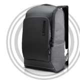
Lenovo Legion 15.6" Recon Gaming Backpack

* Example of Lenovo Legion catalogue naming convention