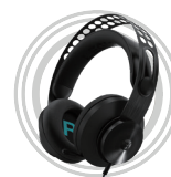
Legion H300 Stereo Gaming Headset