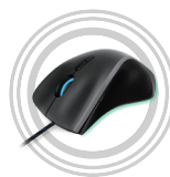
Lenovo Legion M500 RGB Gaming Mouse