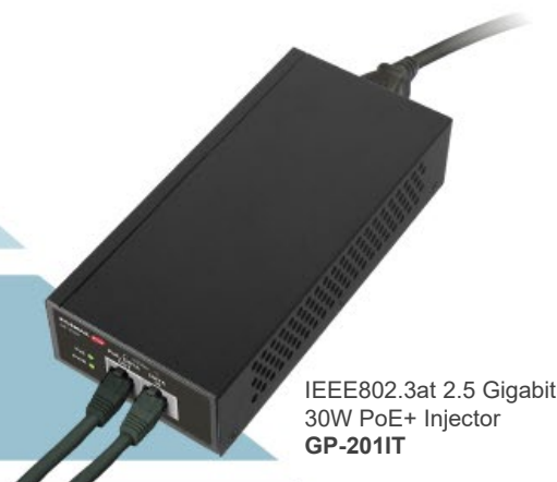
IEEE802.3at 2.5 Gigabit 30W PoE+ Injector GP-2011T