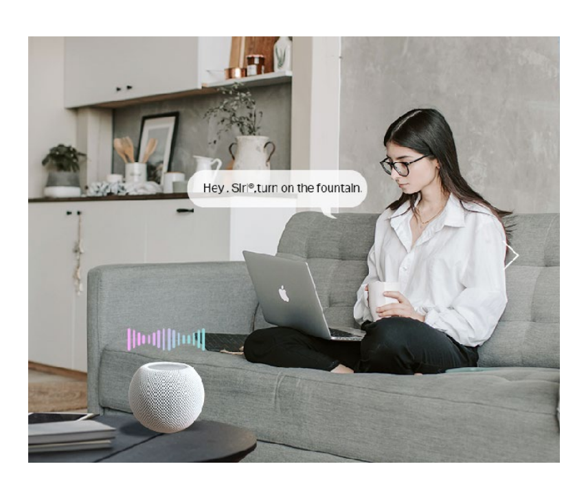
*No hub needed when used in Tapo. Yet if you use it in a third-party app, a Matter hub is needed.

Free up your hands by using simple voice com-mands with Alexa, Siri®, or Google Assistant.