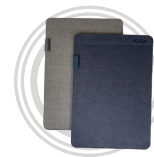
Lenovo Yoga 14.5" Sleeve