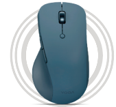
Lenovo Yoga Pro Mouse

* Full headphone functionality requires upcoming software update in Oct 2024.