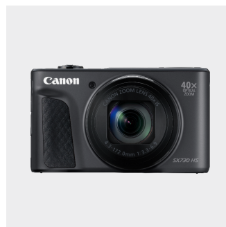
PowerShot SX730 HS