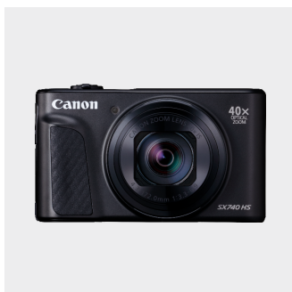
PowerShot SX740 HS LITE EDITION