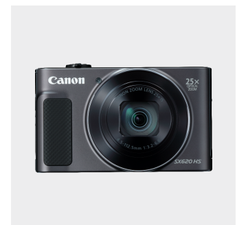
PowerShot SX620 HS