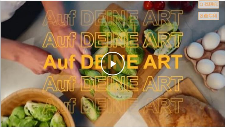
Click for more videos