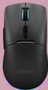
Lenovo Legion M220 Wireless RGB Gaming Mouse GY51U28359

Lenovo may not offer the products, services or features discussed in this document in all regions. Lenovo may withdraw an offering at any time. Information is subject to change without notice. Consult your local representative for information on offerings available in your area. Lenovo reserves the right to change specifications or other product information without notice. Lenovo is not responsible for photographic or typographical errors. Lenovo provides this publication "as is" without warranty of any kind, either express or implied, including the implied warranties of merchantability or fitness for a particular purpose.