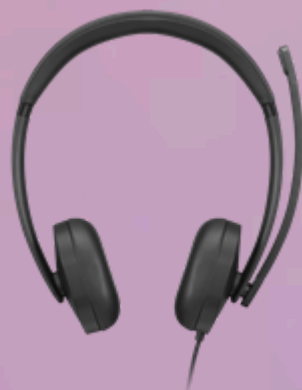
Lenovo Wired VoIP Headset 5000 4XD1R88995

Please click here to view the full list of accessories.