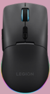
Lenovo Legion M220 Wireless RGB Gaming Mouse GY51U28359

Lenovo may not offer the products, services or features discussed in this document in all regions. Lenovo may withdraw an offering at any time. Information is subject to change without notice. Consult your local representative for information on offerings available in your area. Lenovo reserves the right to change specifications or other product information without notice. Lenovo is not responsible for photographic or typographical errors. Lenovo provides this publication "as is" without warranty of any kind, either express or implied, including the implied warranties of merchantability or fitness for a particular purpose.