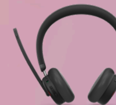
Lenovo Dual-Mode Wireless ANC Headset 6550 (USB-C, Teams) 4XD1S19778