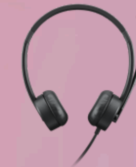
Lenovo Essential Stereo Analog Headset 4XD0K25030