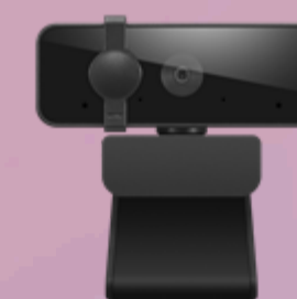
Lenovo Essential FHD Webcam Gen2 4XC1S15018

Please click here to view the full list of accessories.