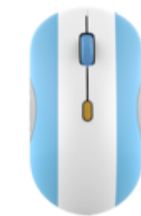
Lenovo 350 Bluetooth Silent Mouse (Fan Edition - Argentina) GY51U71763