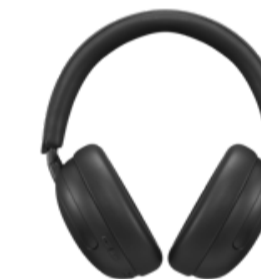
Lenovo Wireless Headphone 2000