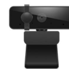
Lenovo 310 FHD Webcam Black