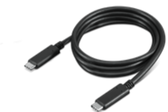
Lenovo USB-C Cable 1m