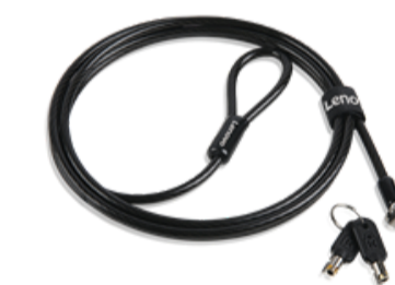
Kensington MicroSaver DS 2.0 Cable Lock from Lenovo