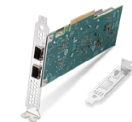
Intel E810-DA2 10/25GbE SFP28 2-Port PCIe Ethernet Adapter