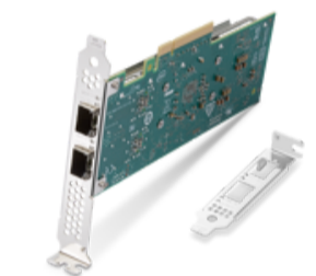
Intel E810-DA2 10/25GbE SFP28 2-Port PCIe Ethernet Adapter