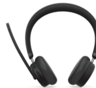
Lenovo Dual-Mode Wireless ANC Headset 6550 (USB-C, Teams) 4XD1S19778