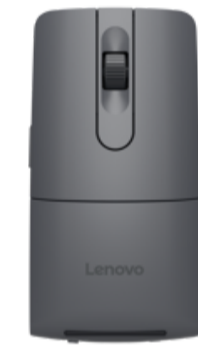
ThinkPad Bluetooth Presenter Mouse (Aura Edition) 4Y51T62792