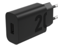
Lenovo 20W USB-A Wall Charger