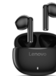
Lenovo E310 True Wireless Stereo Earbuds (Black)