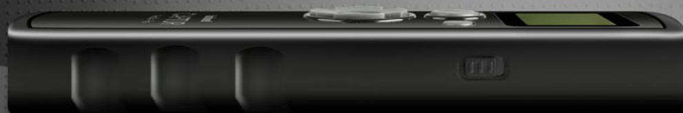
Module - Pro

The Module - Pro has a built-in motion, light and sound sensor as well as a AUX socket to connect 3rd party sensors such as pressure plates. Also included is the Module - IR which can trigger the camera when a moving subject breaks the beam. Ideal for wildlife and sport's photography.