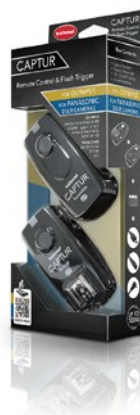
For Oly/Pana: 1000 710.3