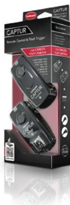
For Canon: 1000 710.0