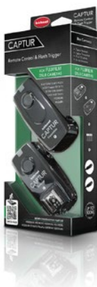
For Fuji: 1000 710.4