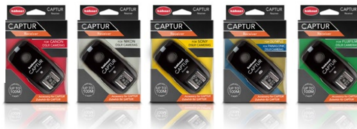
For Canon: 1000 710.5