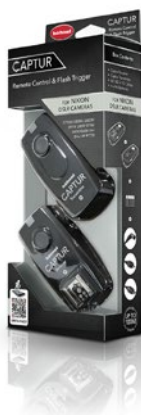
For Nikon: 1000 710.1