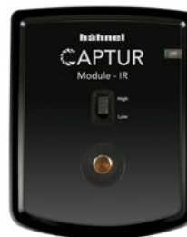
Module - IR