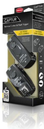
For Sony: 1000 710.2